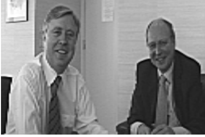
Andrew with Pat Cox, in a lighter moment at the European Parliament

Anti-Europeans cling to the myth that Britain is sovereign over her monetary affairs, and that all freedom to shift policy to suit our national conditions will be lost if we enter the euro. The facts are rather different. The Bank of England sets interest rates more to react to international circumstances than to suit domestic conditions. Indeed, as the Governor of the Bank has admitted, there is no coherent 'one size fits all' policy even for the UK: what suits the City of London is uncomfortable for the North or Scotland.