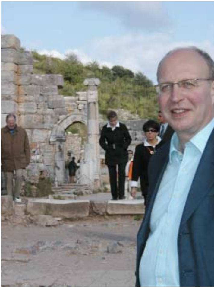
Andrew visits the site where St Paul preached to the Ephesians.

Both Turkey and the European Union need to rise to the challenge of globalisation. Europe's constitutional reforms and Turkey's efforts to assimilate those reforms equip them politically to meet the challenge together. Europe's slowly emerging common foreign, security and defence policy will be highly stimulated by the admission of the Turks.