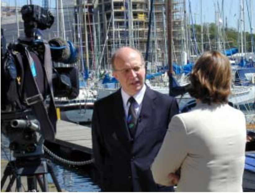
BBC TV News from Ipswich

economy, sterling's interest rates are more than twice as high as those of the euro and Britain's balance of payments deficit is the worst since the eighteenth century. Britain works longer hours than most mainland countries and, in general, achieves lower levels of productivity. Which of us, going abroad this summer, has not enjoyed lower prices?