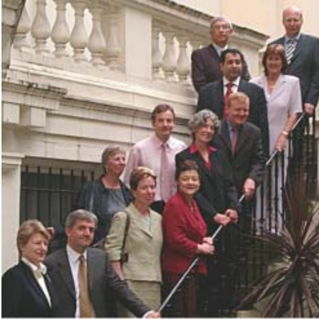
The new Lib Dem MEPs in London with Charles Kennedy

Another regional visit is being organised to the European Parliament in Brussels for Monday 6 - Tuesday 7 December. There is a modest subsidy for expenses, as well as advice about transport and hotels. The event is being specially designed for MPs, peers, PPCs and leading councillors.