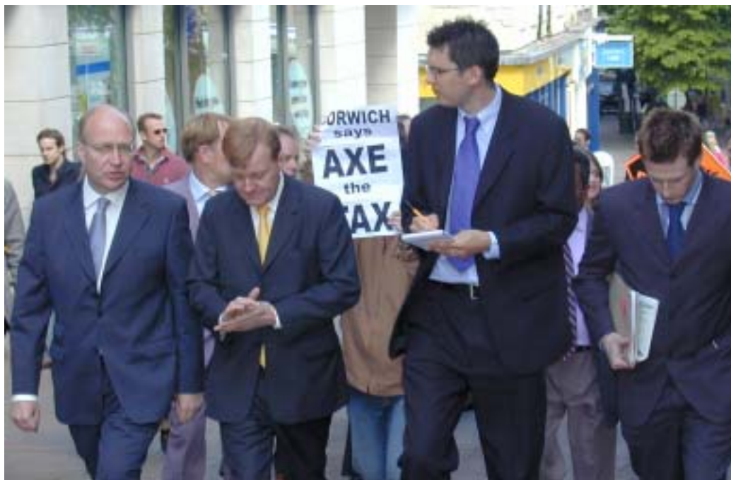
Andrew Duff and Charles Kennedy on the stump in Norwich

Andrew Duff reflects on the election campaign